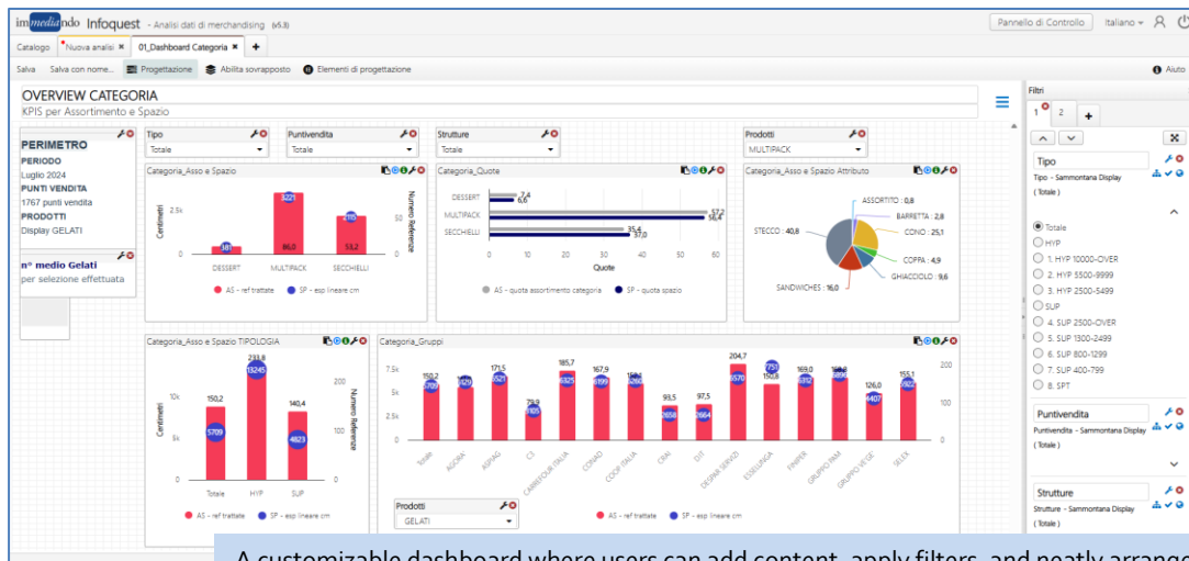
A customizable dashboard where users can add content, apply filters, and neatly arrange panels with drag & drop and snap-to-grid resizing.